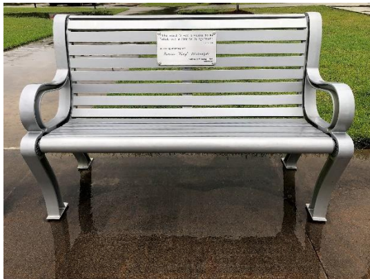
Patricia Wainwright Memorial Tribute Bench