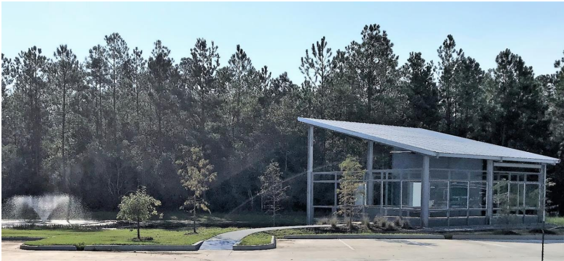
Weeks Marine Outdoor Classroom, Lacombe STEM Campus

Northshore College Enhancement Foundation 65556 Centerpoint Blvd. Lacombe, LA 70445