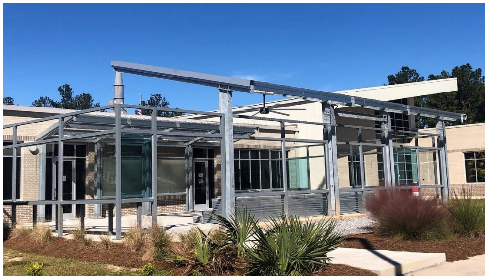
STEM Outdoor Classroom, Lacombe Campus