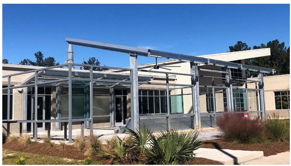
STEM Outdoor Classroom, Lacombe Campus